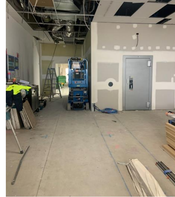
Construction of acoustically rated solid plaster walls, new air-conditioning system and installation of joinery in accordance with the Pharmacy Board