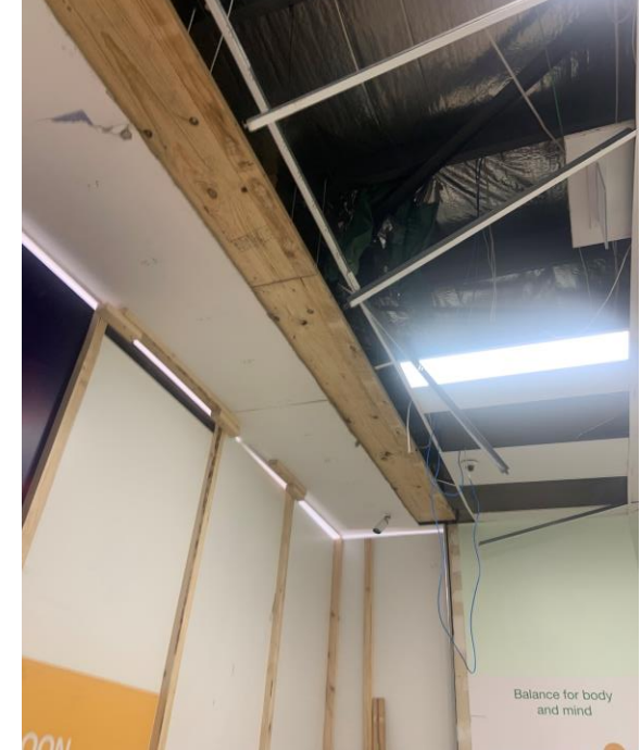
Removal of existing non-complaint shopfront and installation of new in accordance with National Construction Code (NCC) 2022