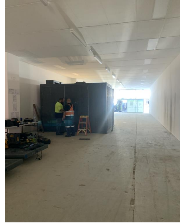
Construction of a new 10.5 tone vault to dispense Medicinal Cannabis in accordance with the Office of Drug Control (ODC) and the Pharmacy Board of Australia.