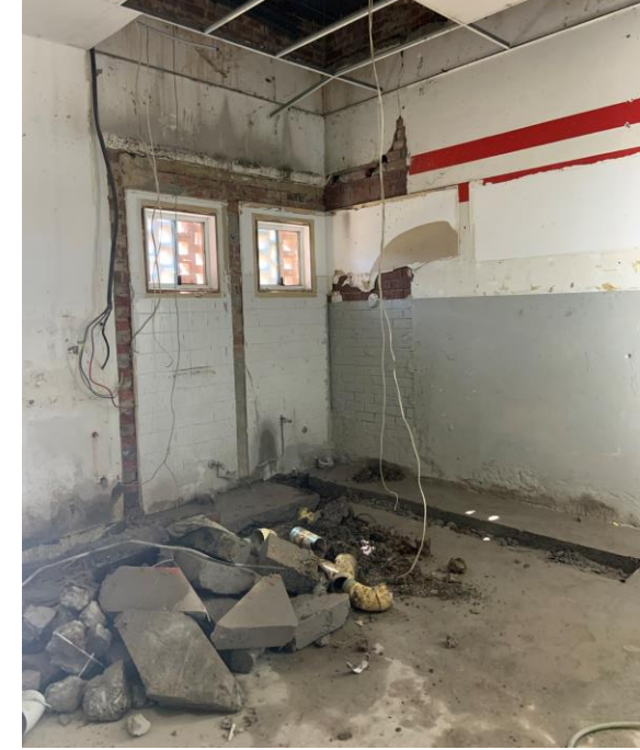
Demolishing of existing toilets, removal of Asbestos and construction of new disabled toilets in accordance with (DDA) 1992